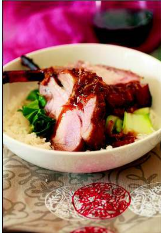
Chinese-flavoured pork rack.