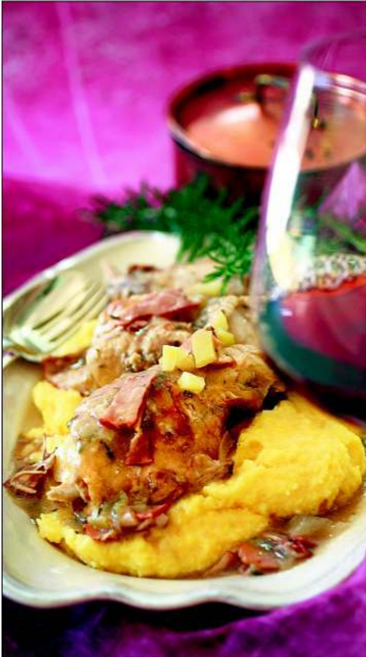
Rabbit with thyme and polenta.